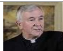
Archbishop Vincent Nichols Mass for the Sick Westminster February 2010

'A culture of true compassion and healing fosters a deep respect and attentive care of the whole person, it promotes genuine care characterised by a sense of humility, a profound respect for others, and a refusal to see them as no more than a medical or behavioural problem to be tackled and resolved'